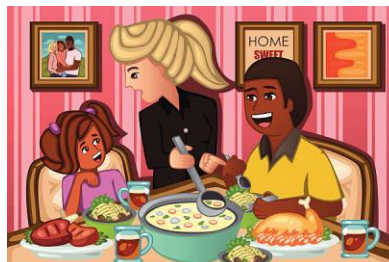
Think of the happiness!