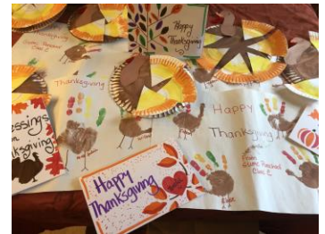
This week we sent 10 Thanksgiving cards and our GUMC Preschool sent 7 paper plate turkeys and 4 classroom handprint turkey posters!

Our Donations Total is reset! Nov. – April Total: $100